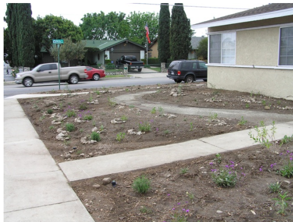
Conservation Makeover in Rancho Cucamonga: before and after (just completed) WATCH OUR CONSERVATION GARDENS GROW & BLOOM !

CONTACT THE SGMIA GO GREEN TEAM NOW FOR MORE INFORMATION, OR FOR A CONSERVATION MAKEOVER APPOINTMENT: